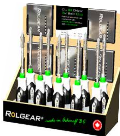
Counter Display with Bit Drivers and Belt Clip Bit Pack.