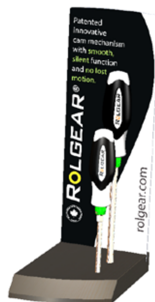
POP Demo Display for counters.