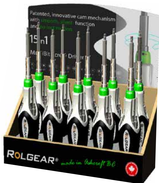
Multi-Bit 10 Piece Counter Display.